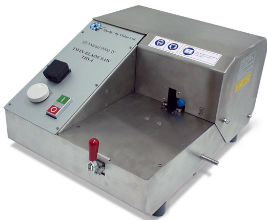
TBS-4A Automatic food Twin Blade Saw