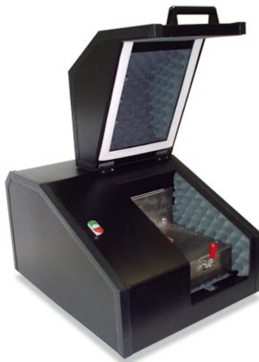
Option - Noise Reducer Case