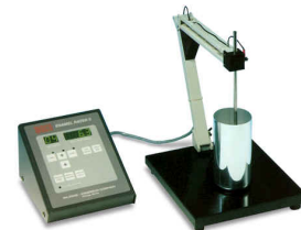
Enamel rater II

The instrument operates in industry standard 4 second mode, continuously, or can be programmed to measure any desired time. In 4-second mode, the display shows the reading only at 4 seconds.