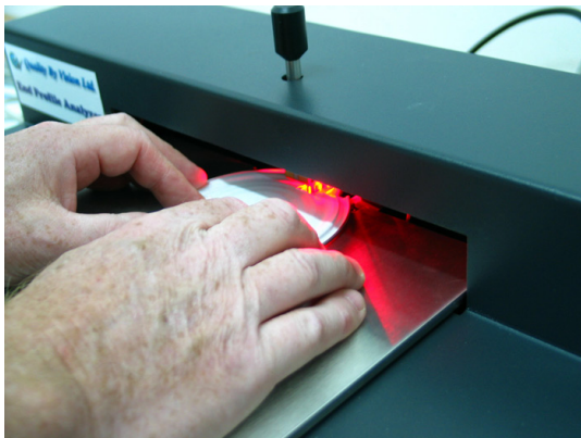
Profiling in action