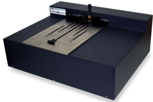
EPA optical unit