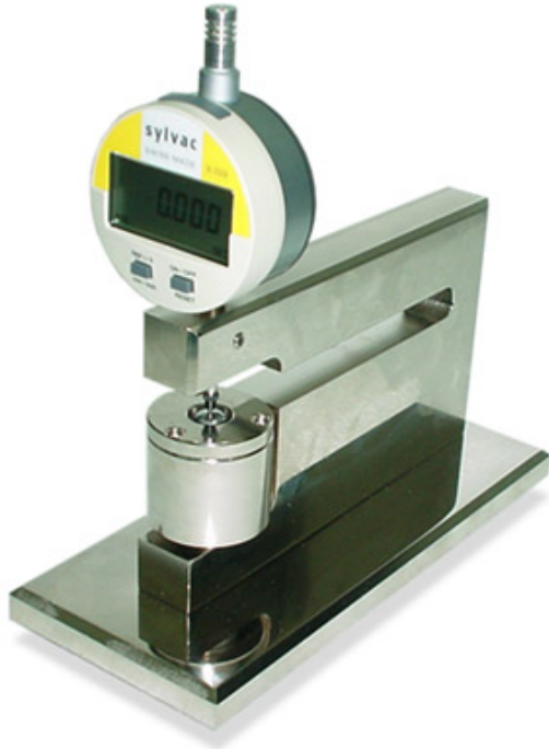
High accuracy end material thickness gauge