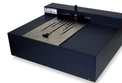
End Profile Analyzer unit